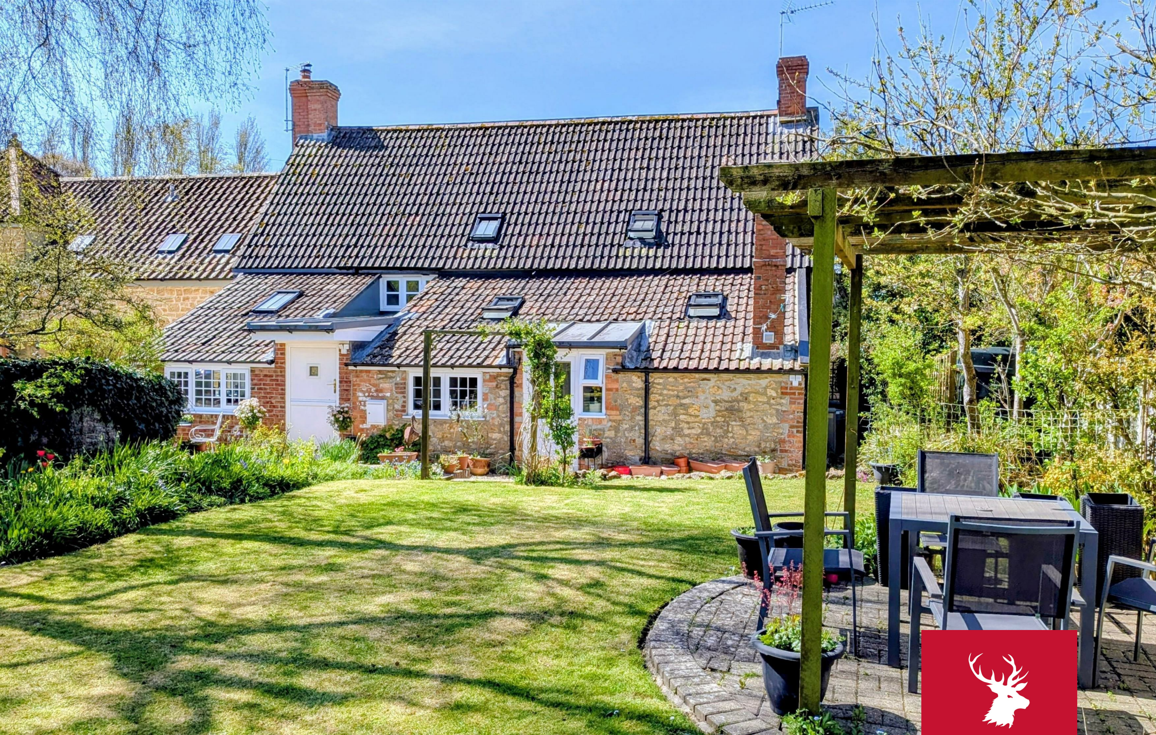
Old Smithy Farmhouse