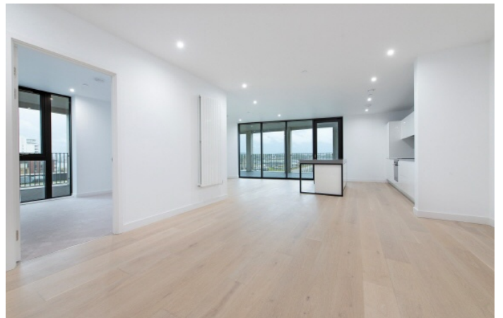
Schooner Road, E16