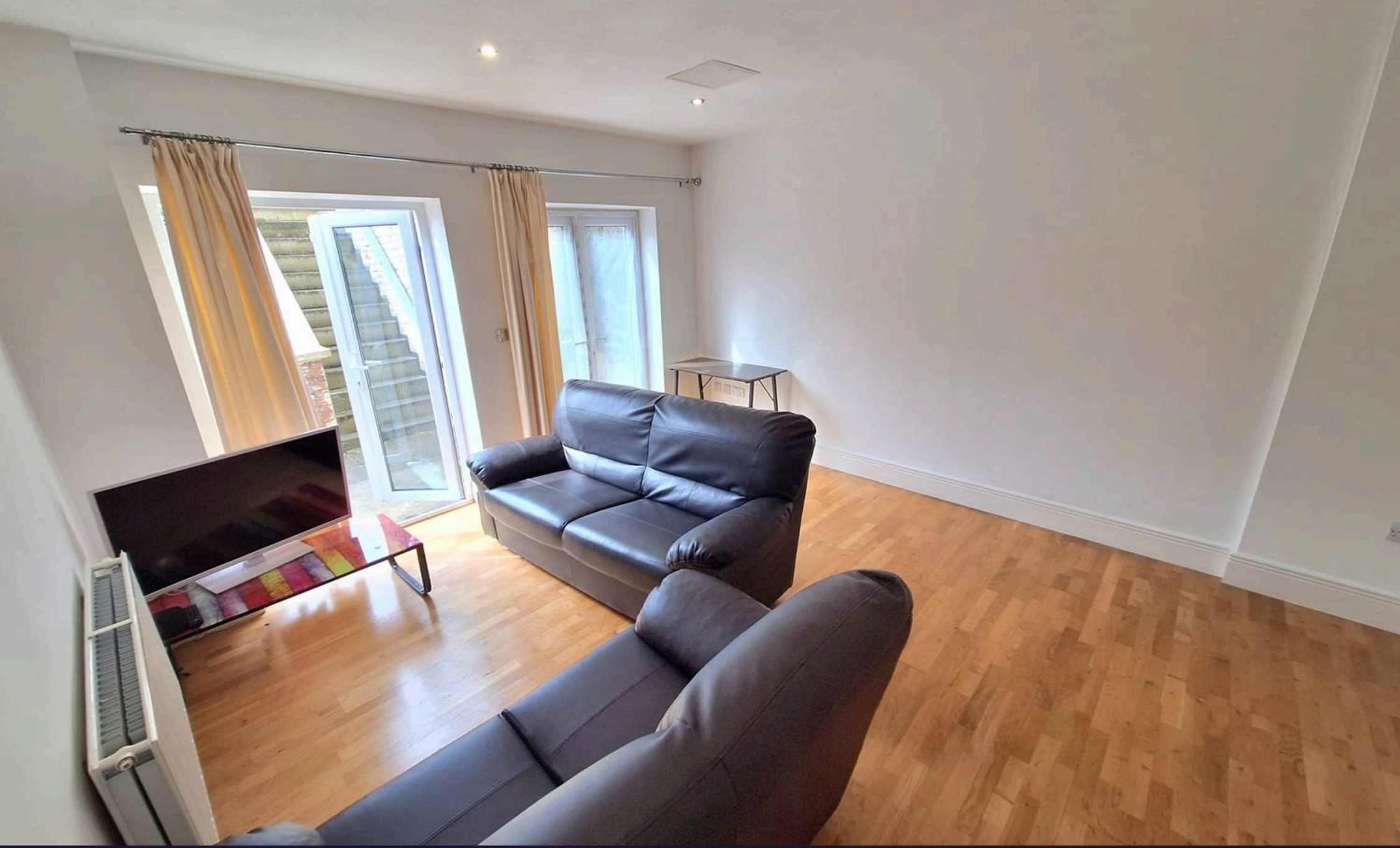
Apt 4, The Ropewalk, Nottingham £1,100 pcm