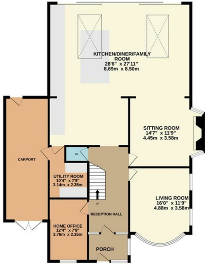
GROUND FLOOR 1562 sq.ft. (147.0 sq.m.) approx.