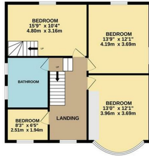
FIRST FLOOR 761 sq.ft. (70.7 sq.m.) approx.