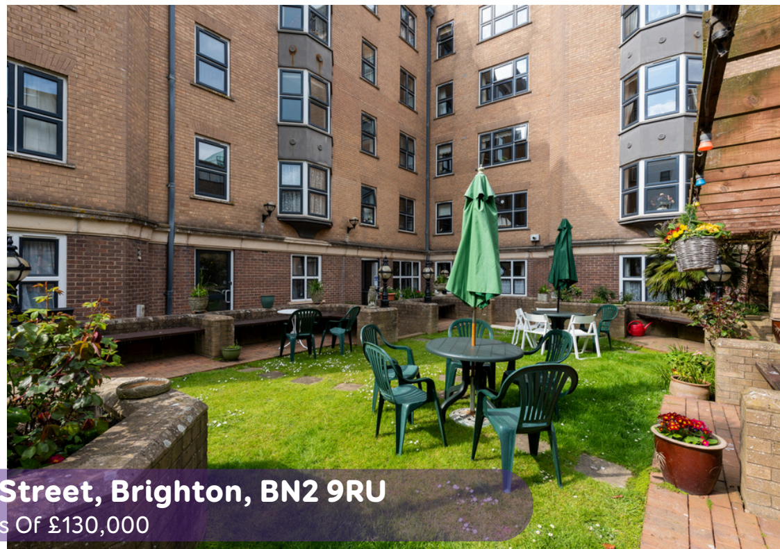
Pavilion Court, William Street, Brighton, BN2 9RU Offers In Excess Of £130,000