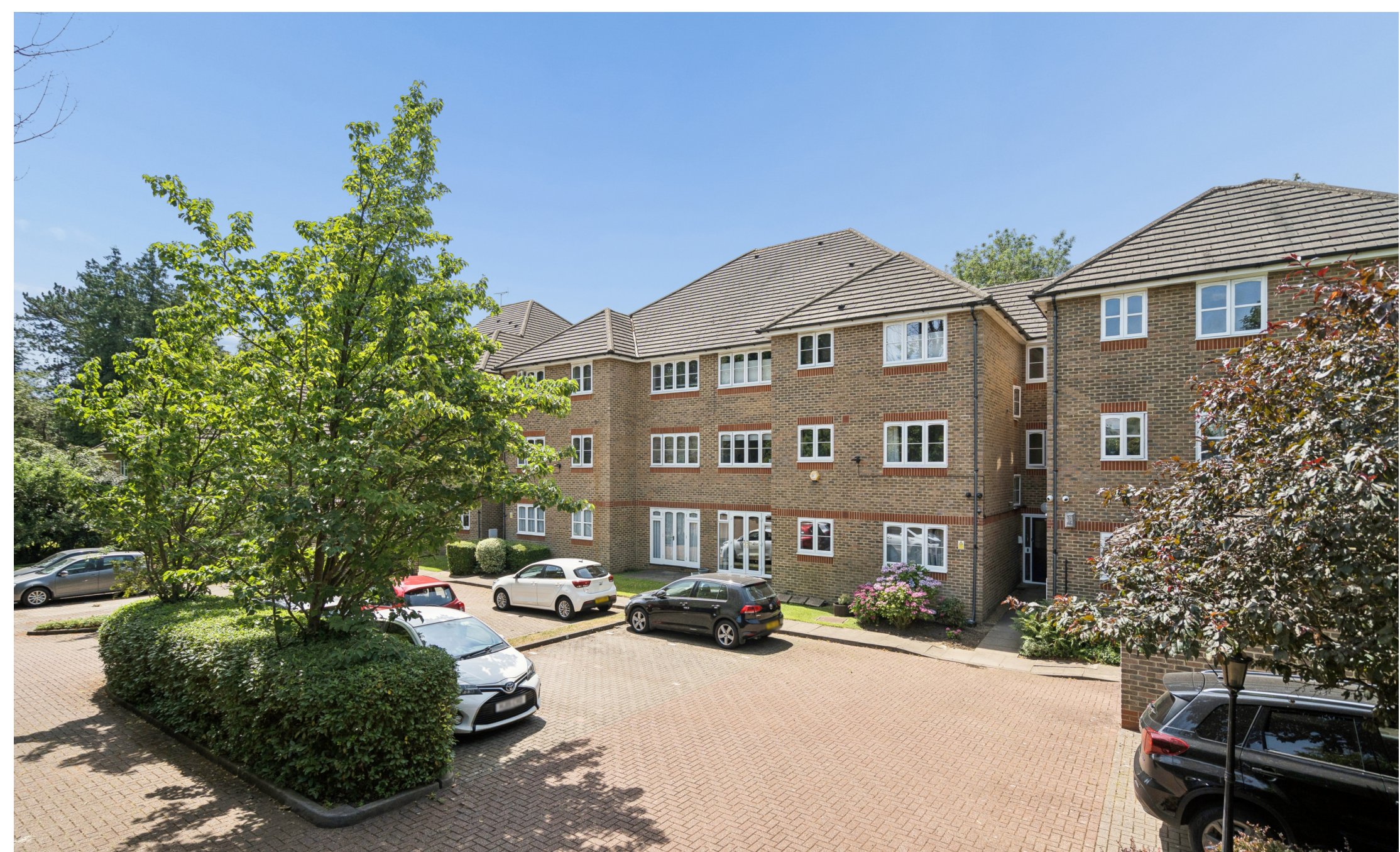
A two bedroom second floor apartment in a convenient location Skillen Lodge, Pinner, Middlesex HA5 3PR