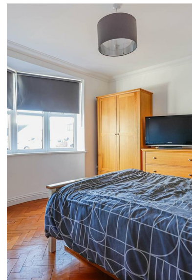
The Gazelles, Pencoeudre Road, Barry, CF63 1SE