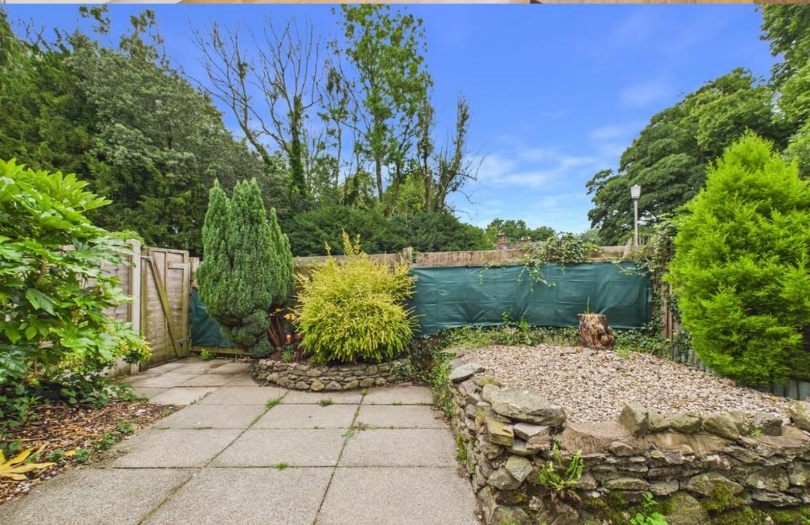
Enclosed Rear Garden