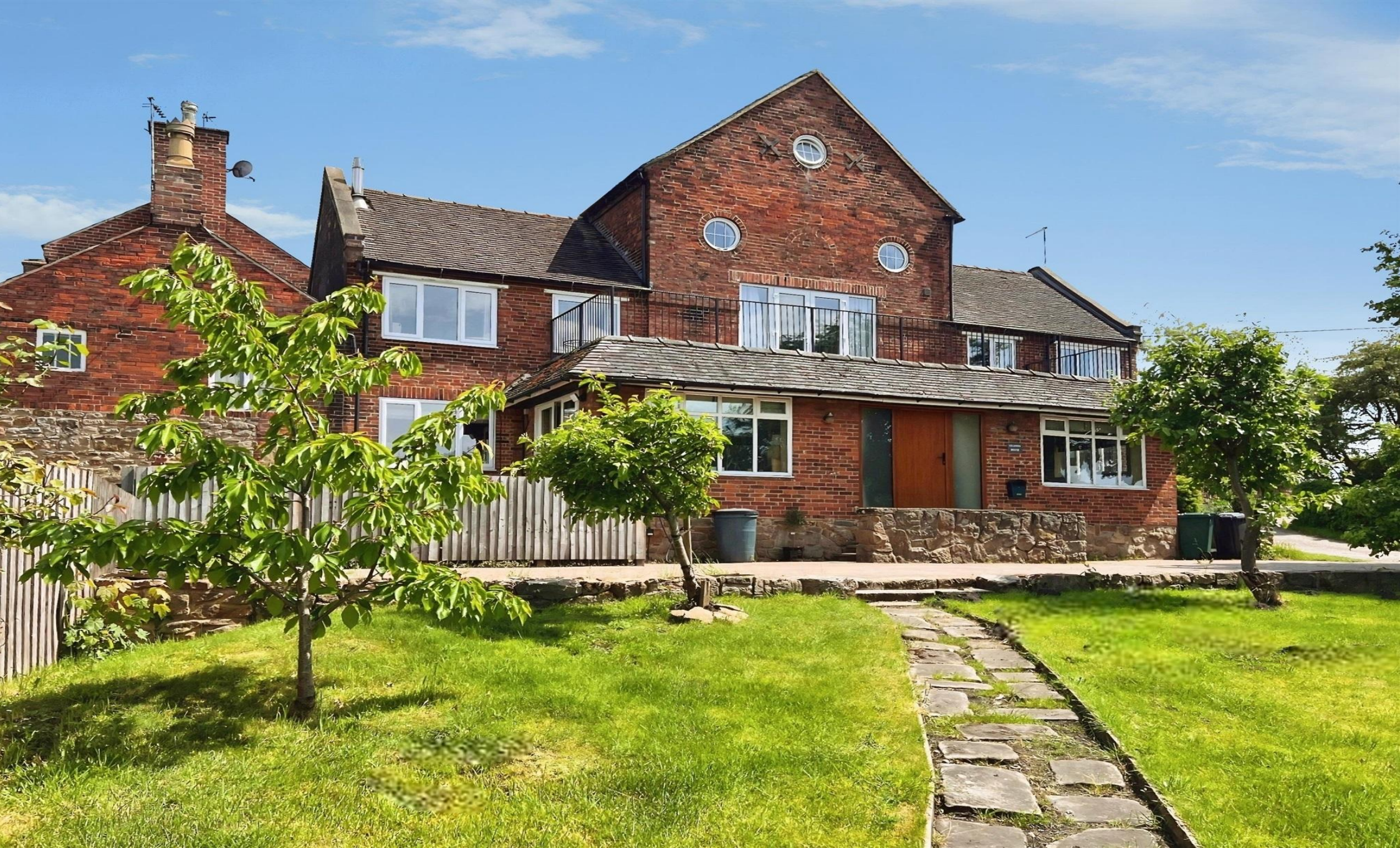
Stanton House Ingleby Road Stanton-By-Bridge Derby