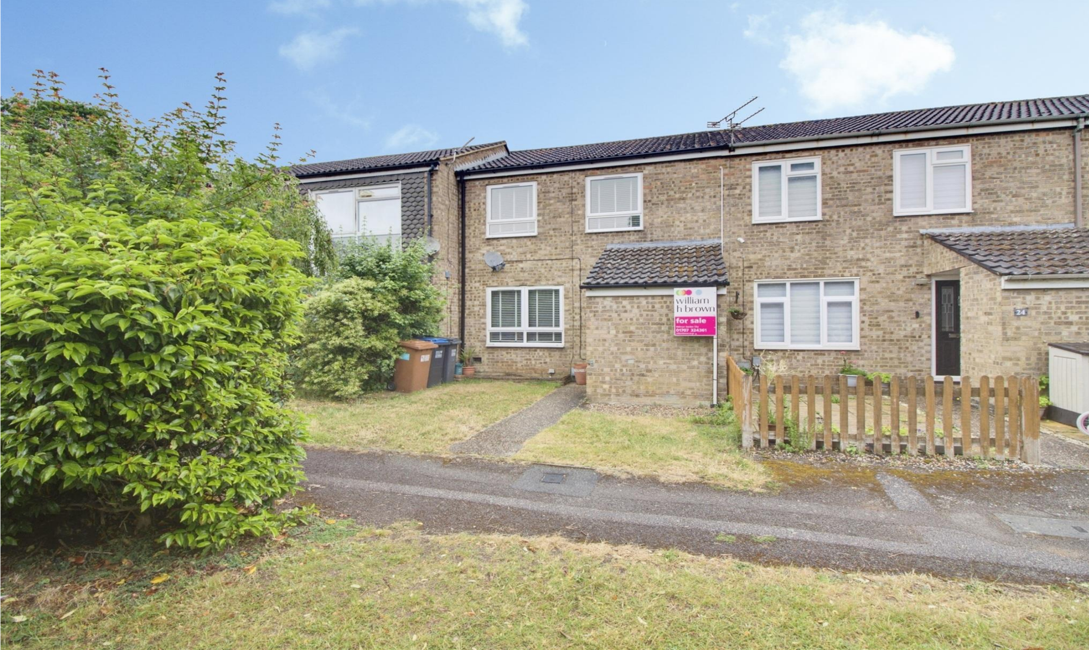
Baldwins, WELWYN GARDEN CITY AL7 2BD