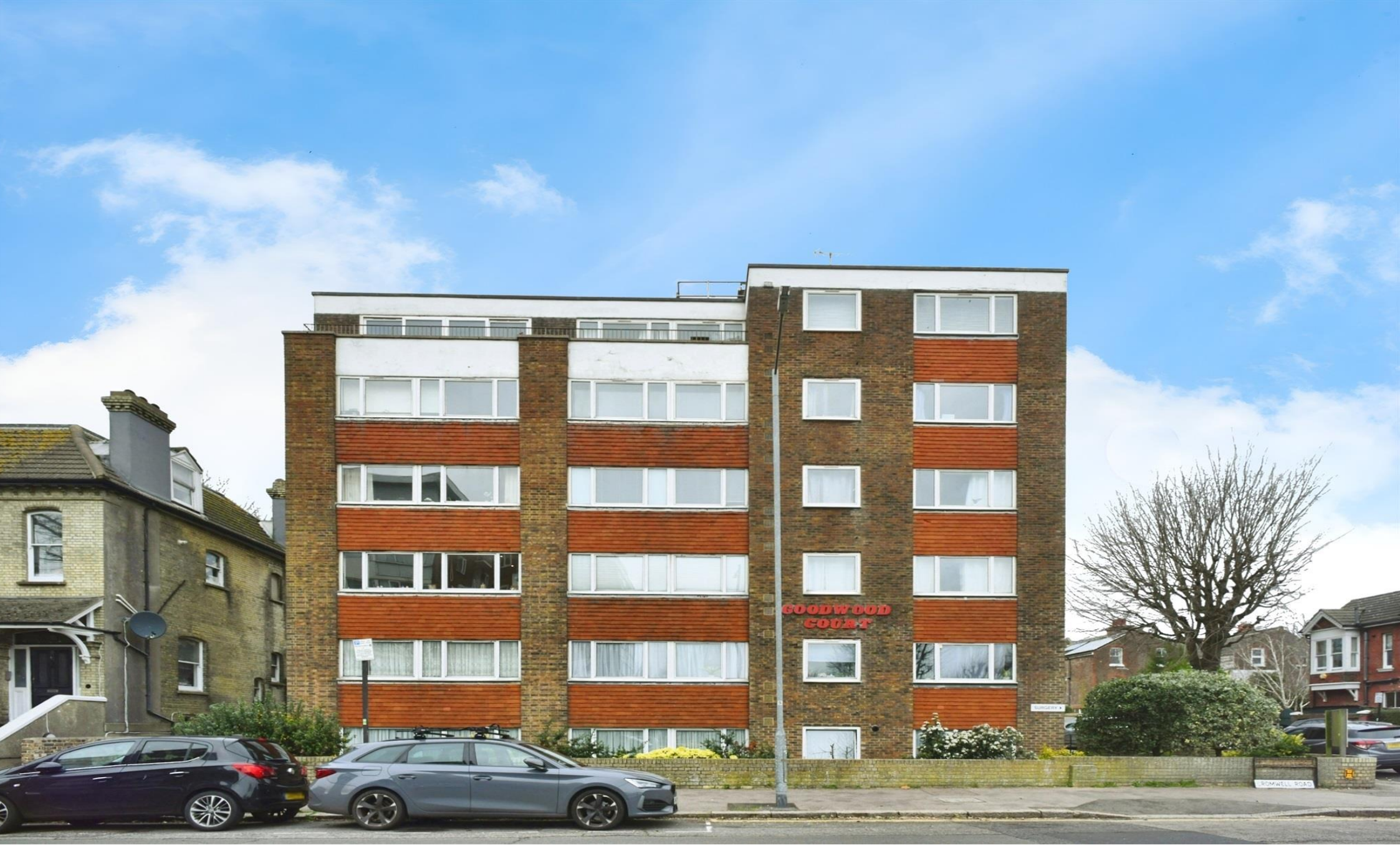
Goodwood Court Cromwell Road, Hove BN3 3DX