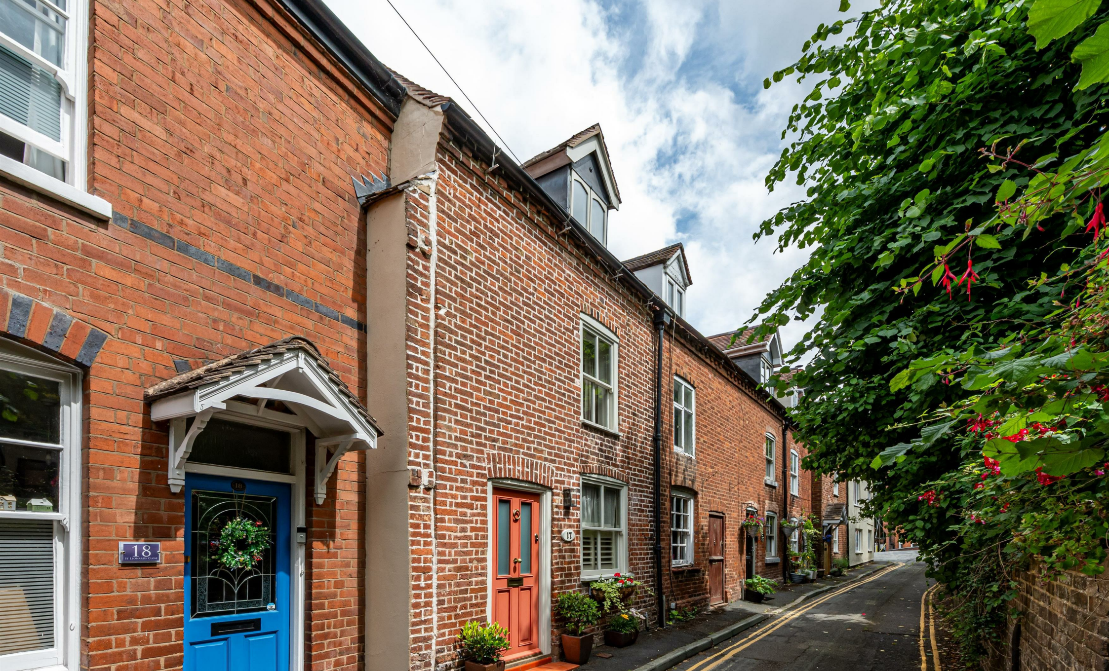
17 St. Leonards Close, Bridgnorth, WV16 4EJ