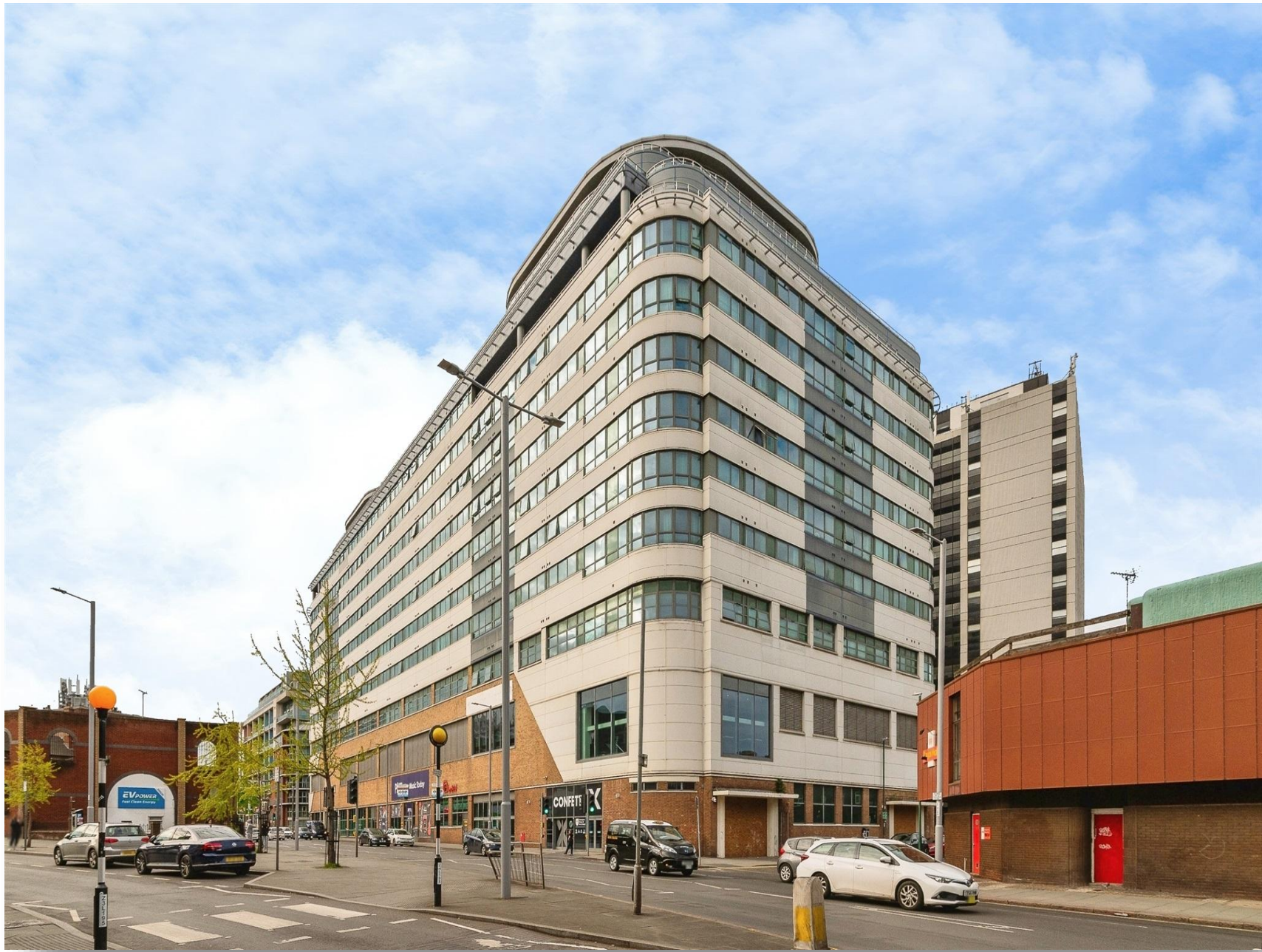
Marco Island Huntingdon Street, Nottingham NG1 1AS