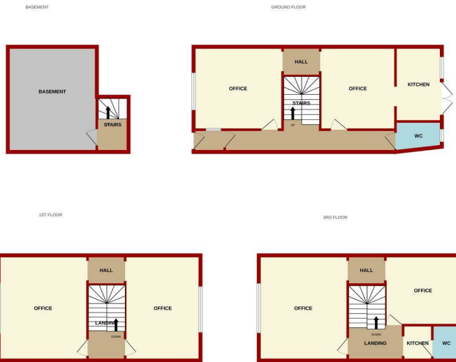
Measurements are approximate. Not to scale. Illustrative purposes only Made with Metropix ©2025