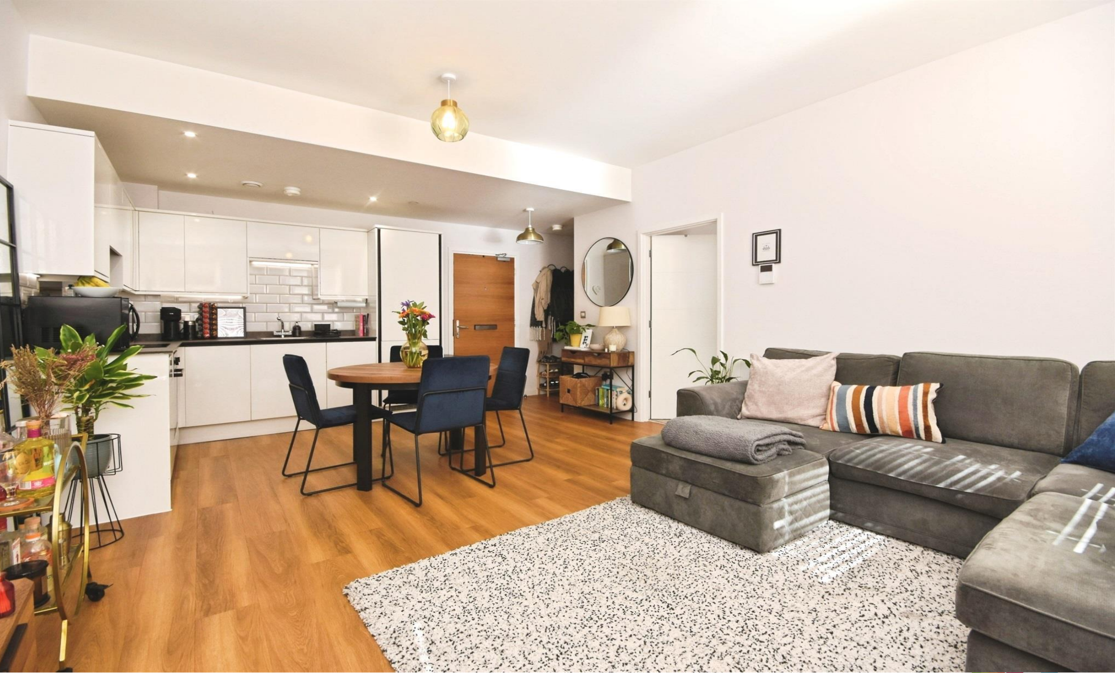
Ingrave House, Ingrave Road, Brentwood, CM15 8TG