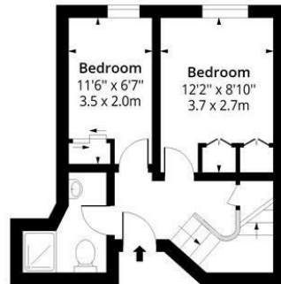
Third Floor Floor Area 318 Sq Ft - 29.54 Sq M