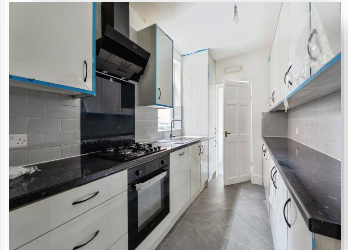
Browning Street, Leicester LE3 0JL