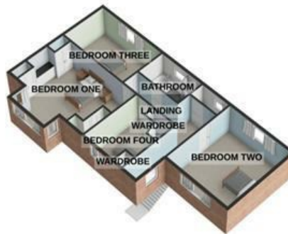
TOTAL FLOOR AREA : 1988 sq.ft. (184.7 sq.m.) approx.

For illustrative purposes only. Decorative finishes, fixtures, fittings and furnishings do not represent the current state of the property. Measurements are approximate. Not to scale.