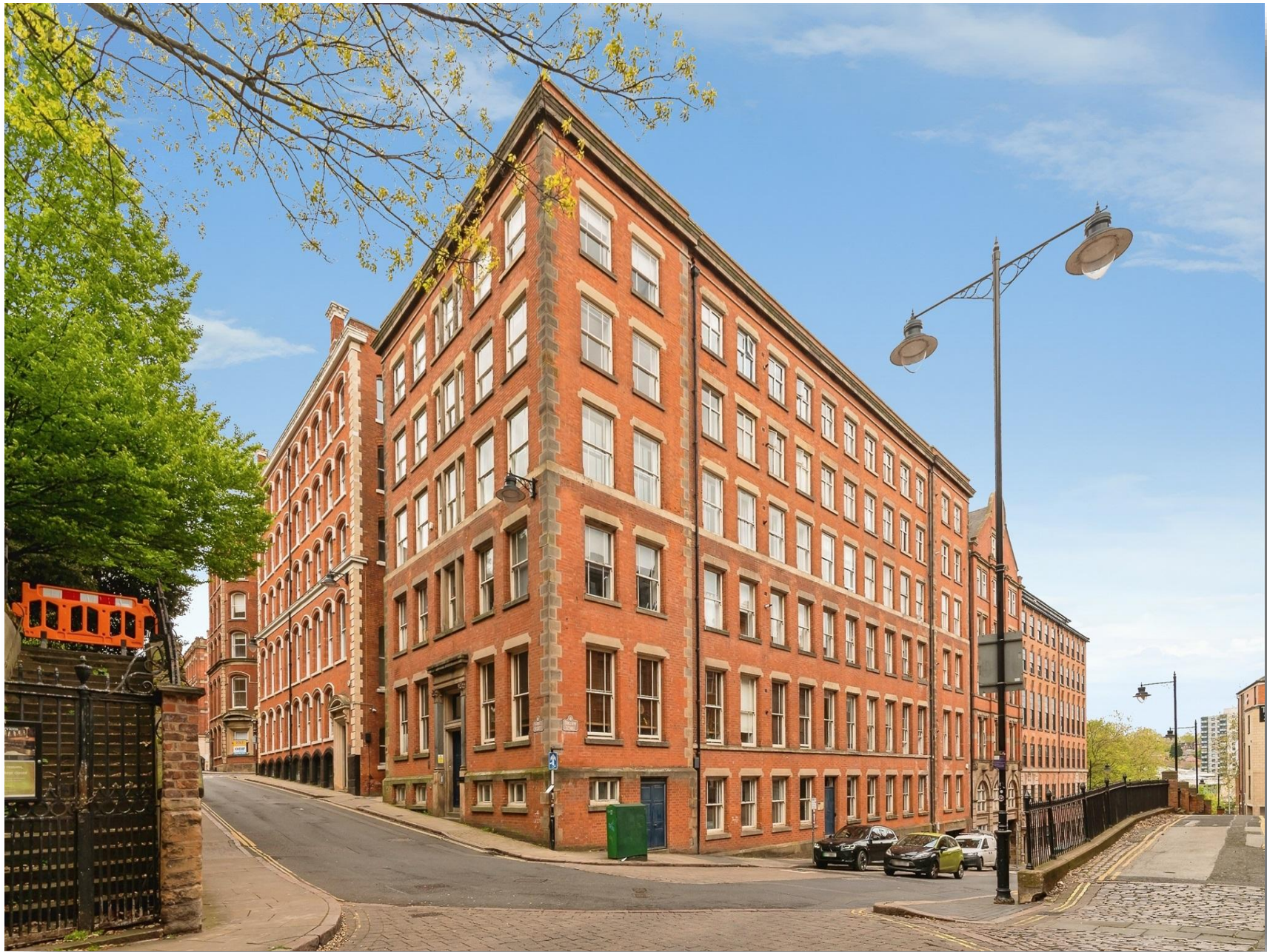
Stoney Street, Nottingham NG1 1QX