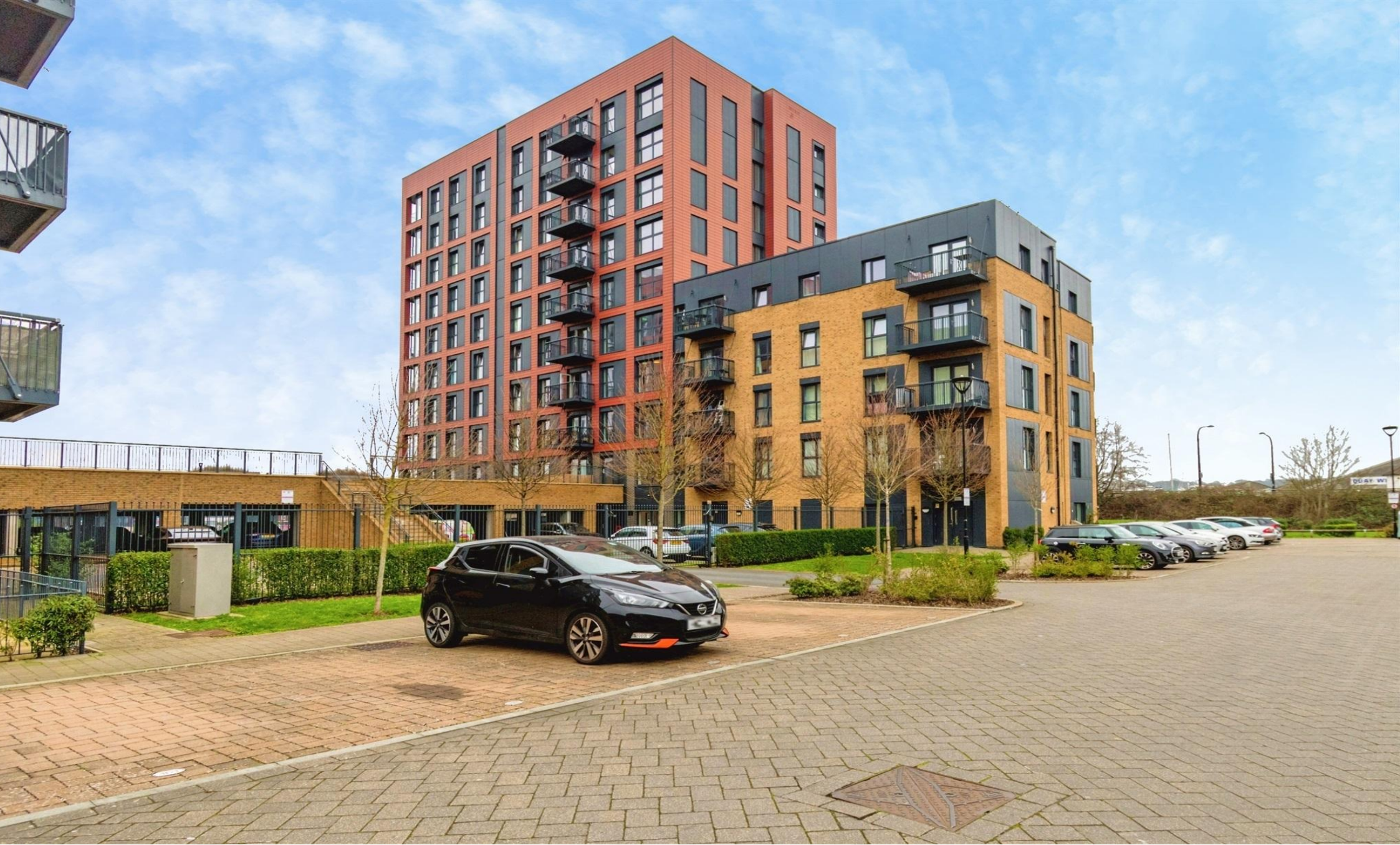
Television House, Meridian Way, Southampton SO14 0FS