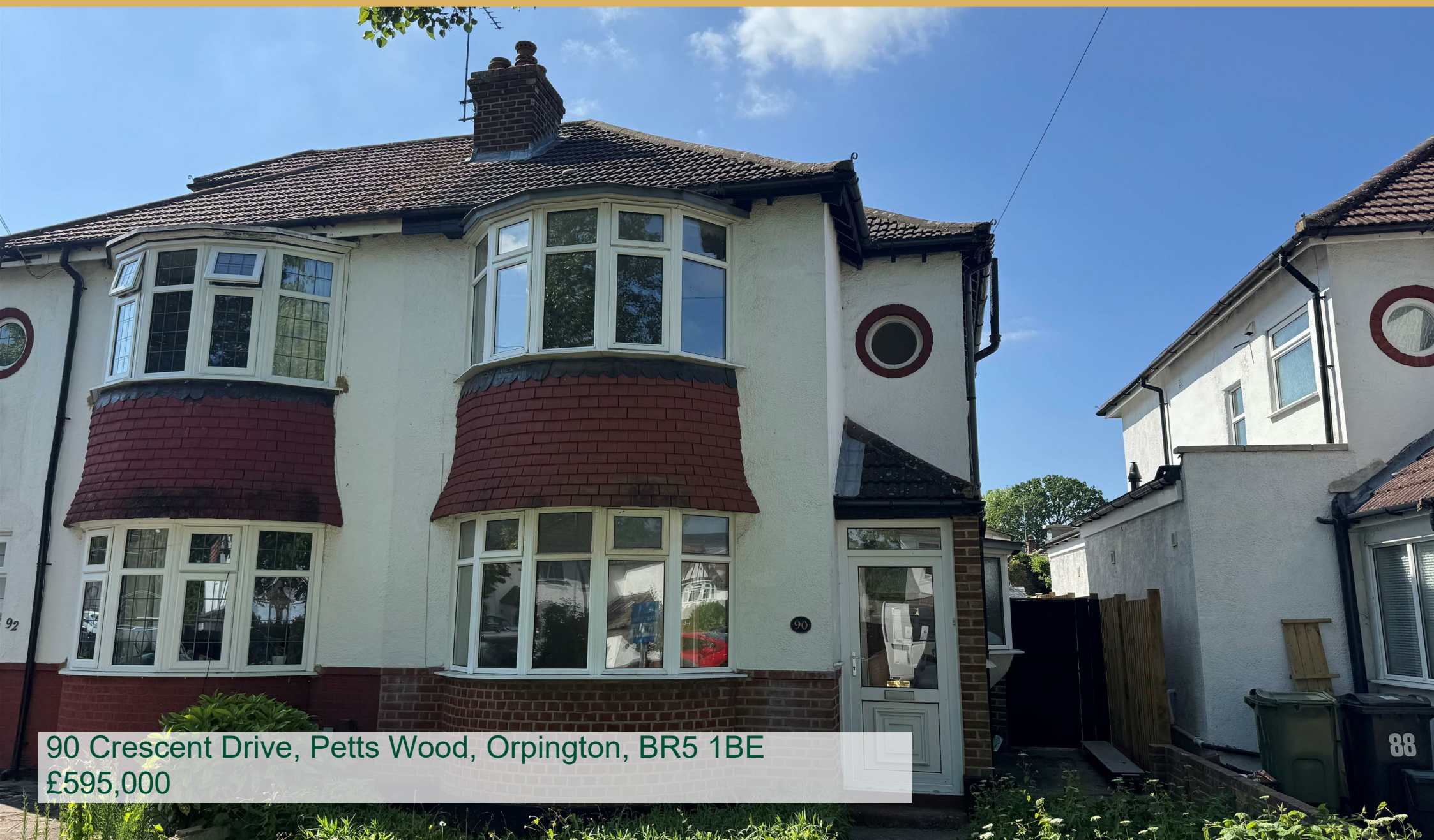
90 Crescent Drive, Petts Wood, Orpington, BR5 1BE £595,000