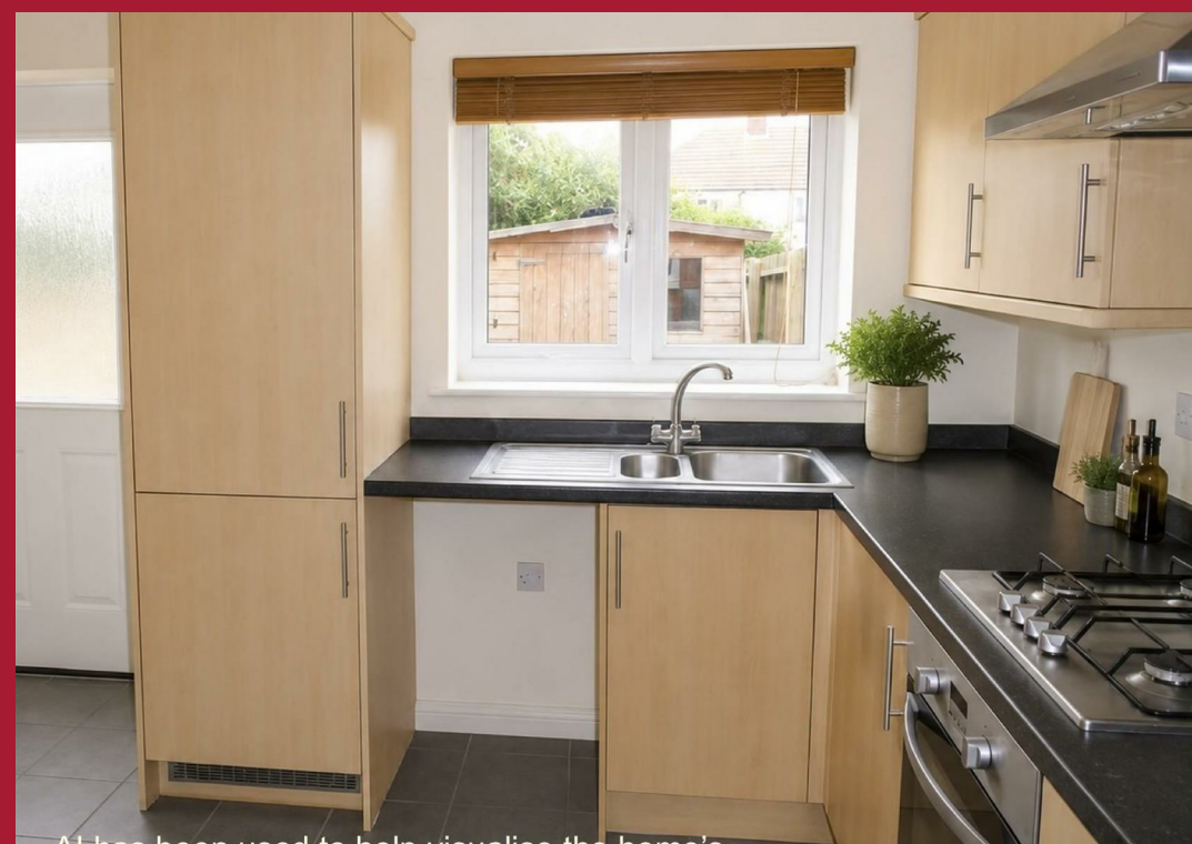
AI has been used to help visualise the home's