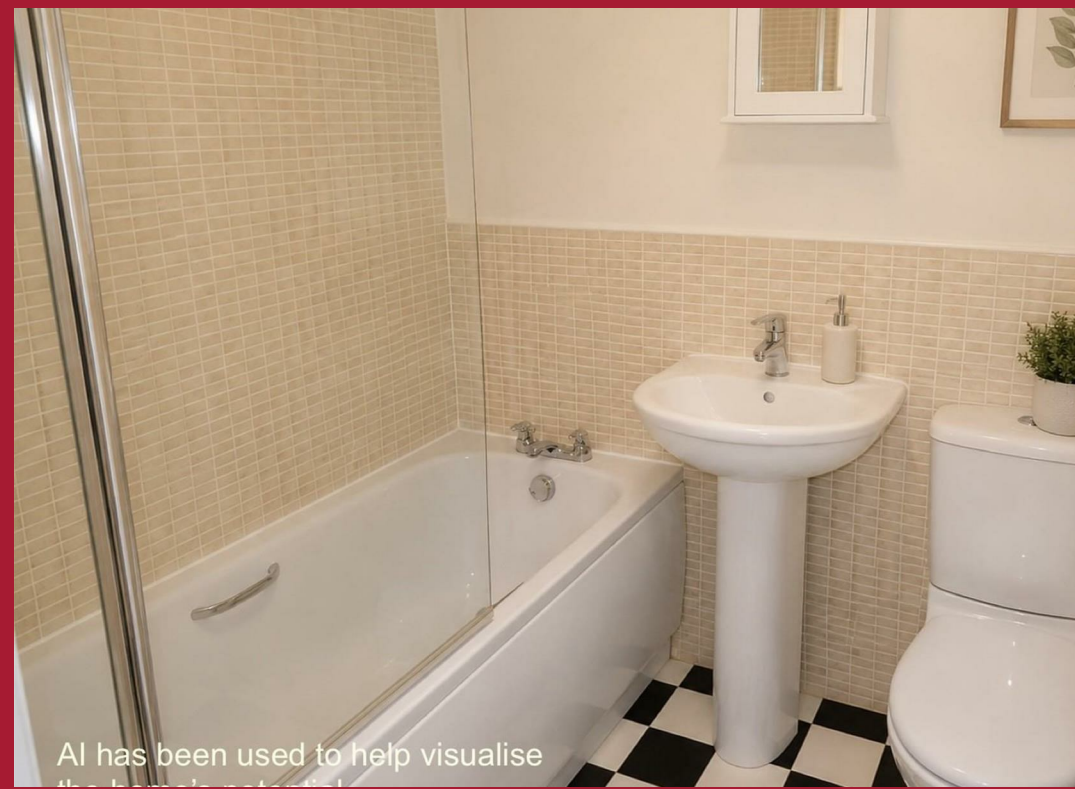
AI has been used to help visualise