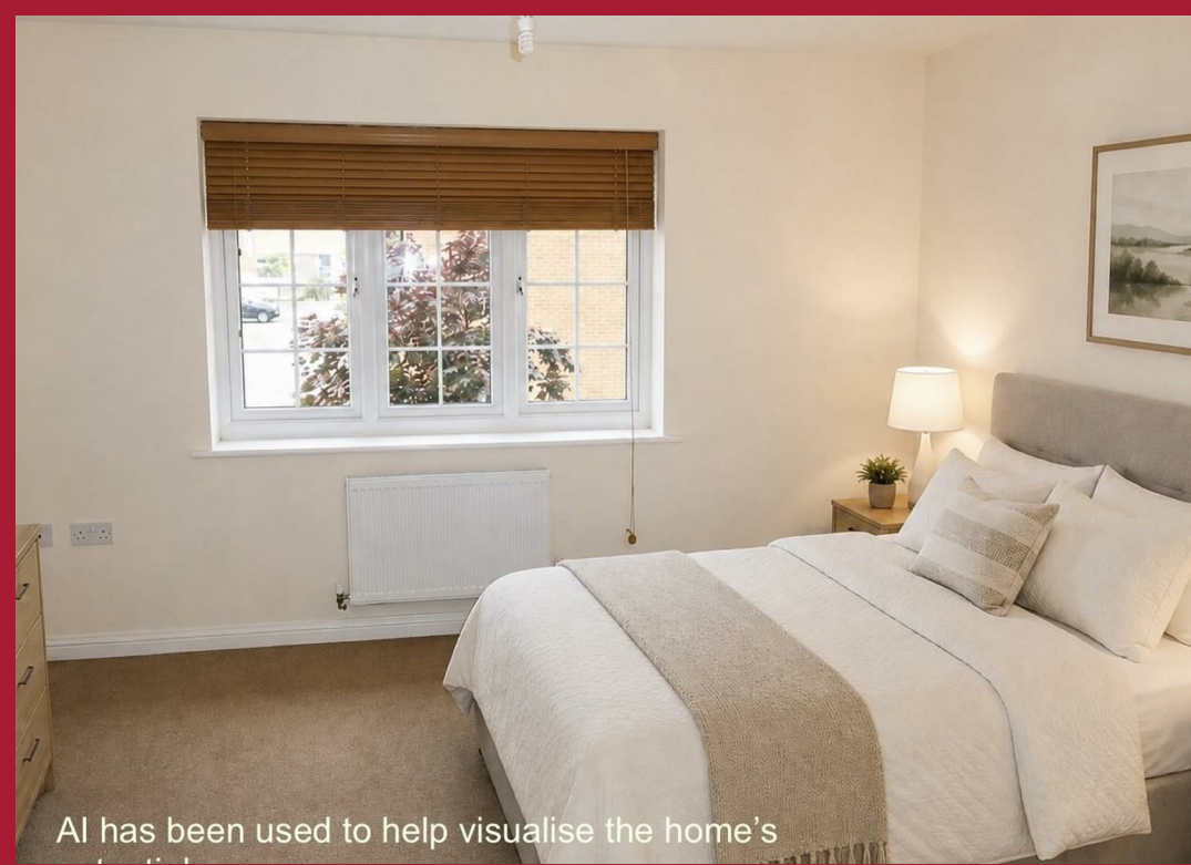
AI has been used to help visualise the home's