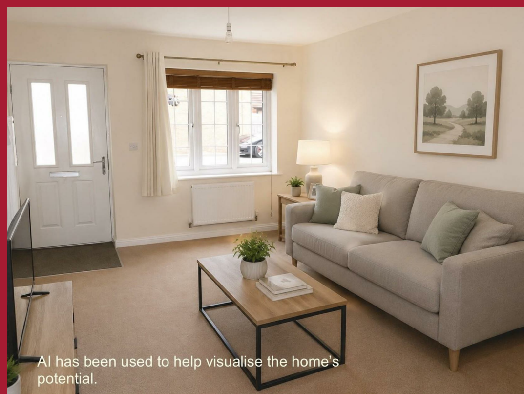
AI has been used to help visualise the home's potential.