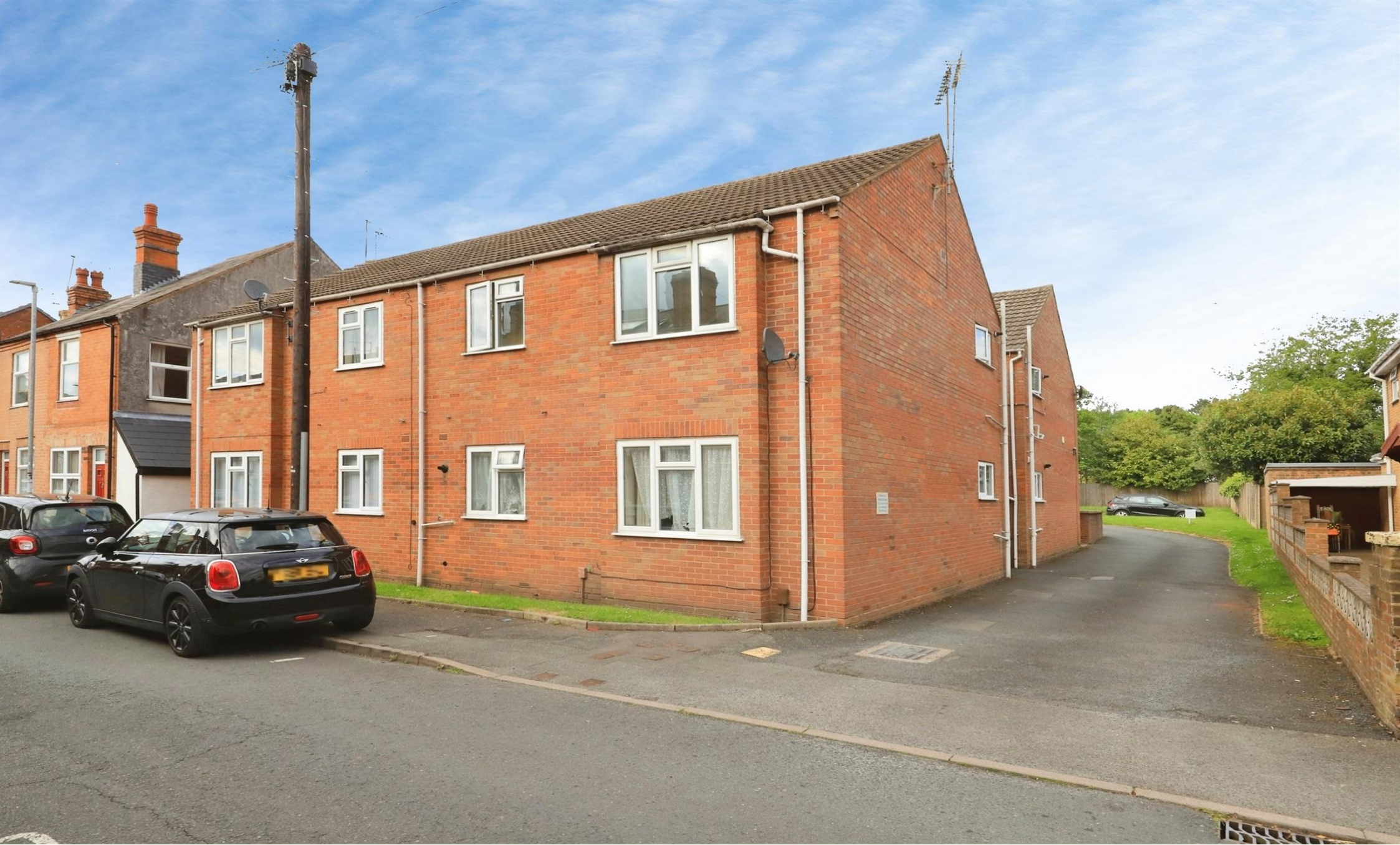
Shrubbery Court Shrubbery Street, Kidderminster DY10 2QY