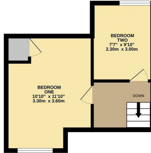
1ST FLOOR 269 sq.ft. (25.0 sq.m.) approx.