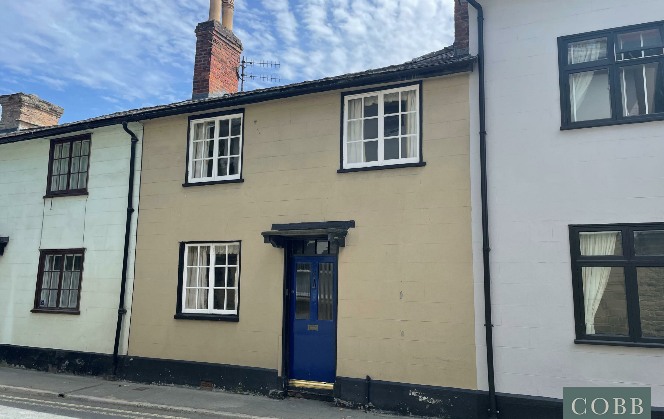
24, Duke Street, Kington, HR5 3BL Price £185,000