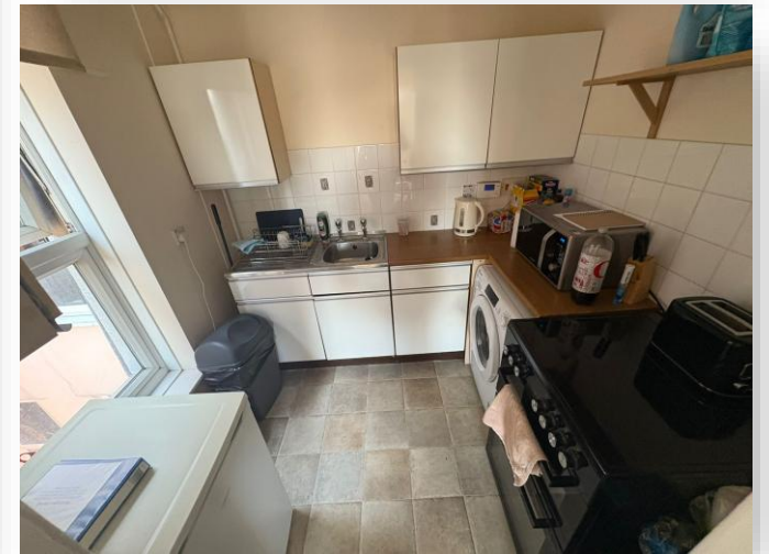
Harfield Court Lyon Street, Bognor Regis PO21 1EE