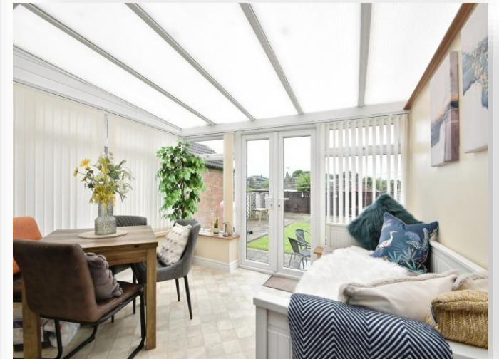
Forest Grove, Harrogate HG2 7JU