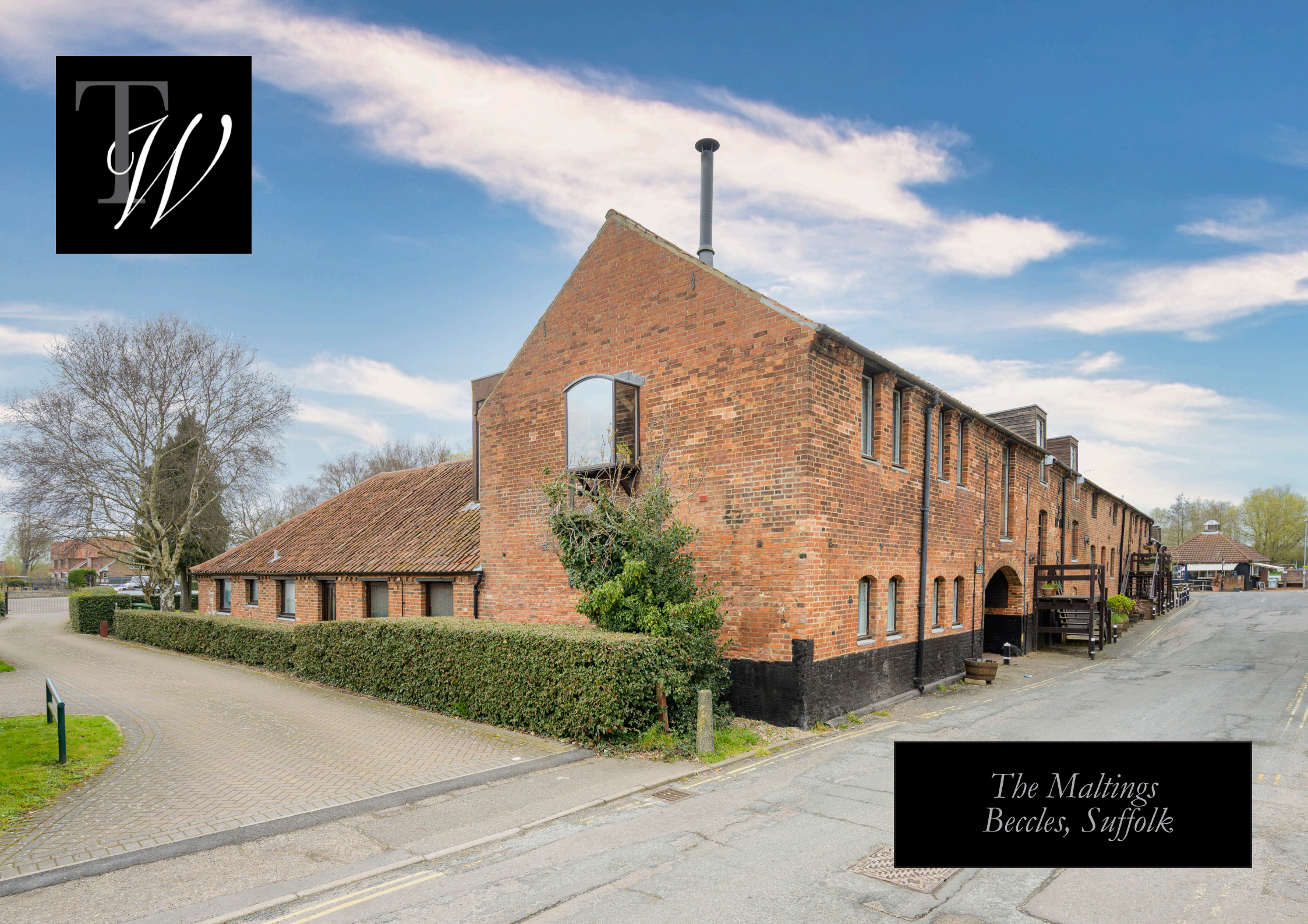
The Maltings Beccles, Suffolk