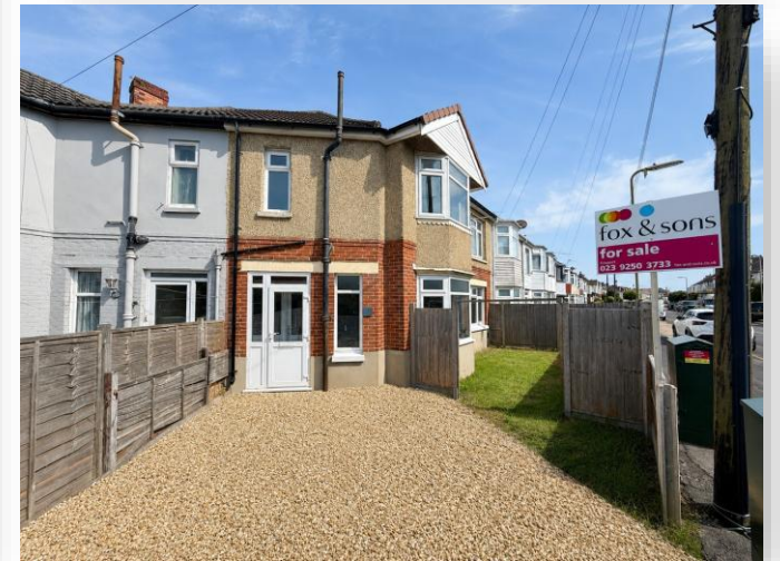
Grange Crescent, Gosport, PO12 3DS