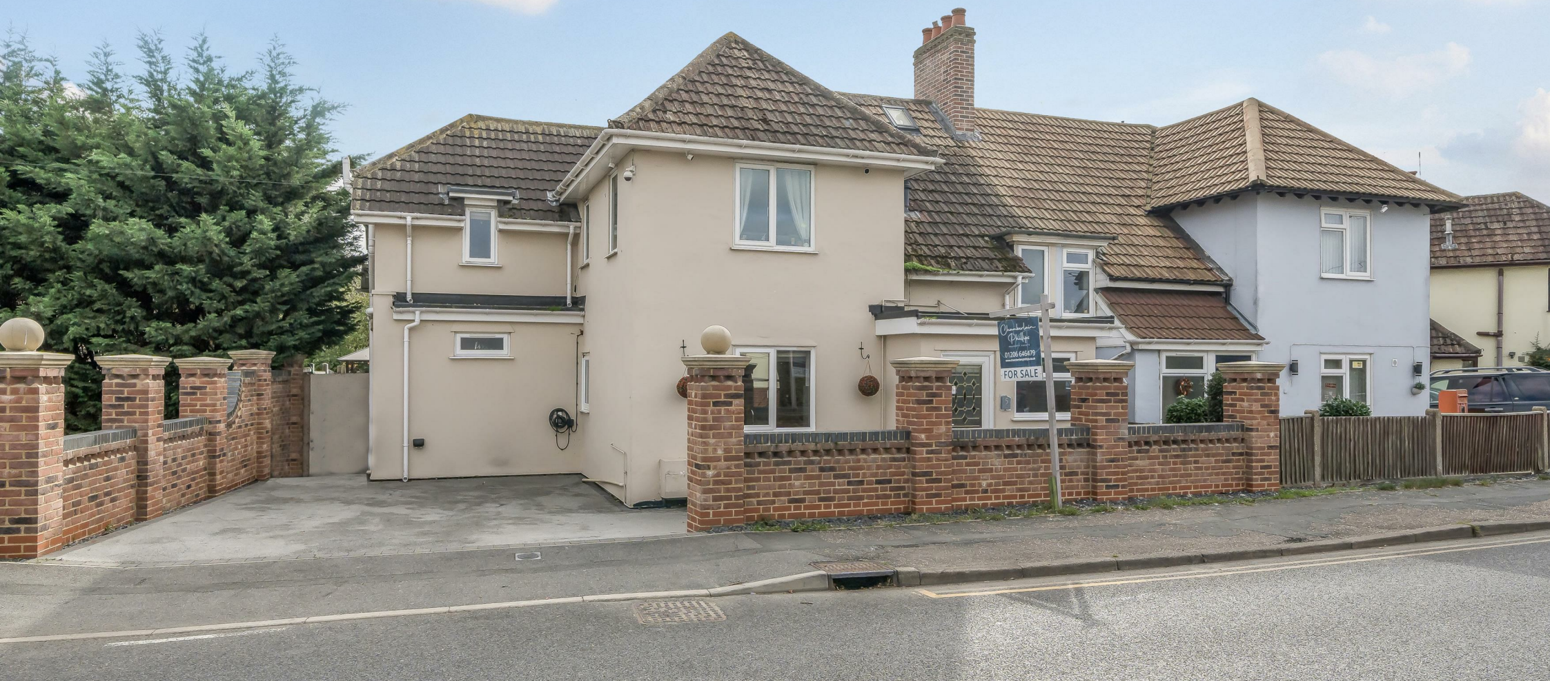
Bromley Road, Elmstead Guide Price £525,000 - £530,000