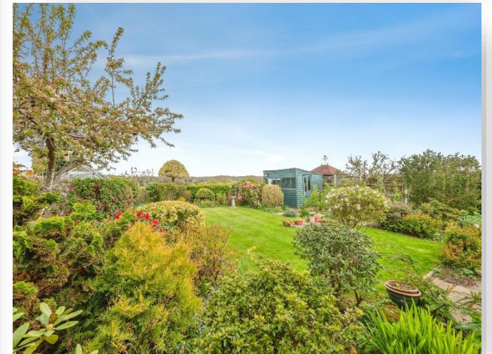
Swafeld Rise, North Walsham NR28 0DG