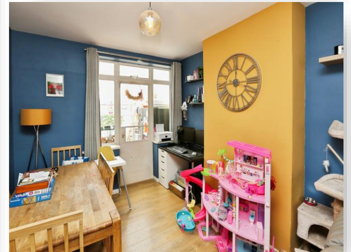
Worthing Avenue, Gosport, PO12 4DB