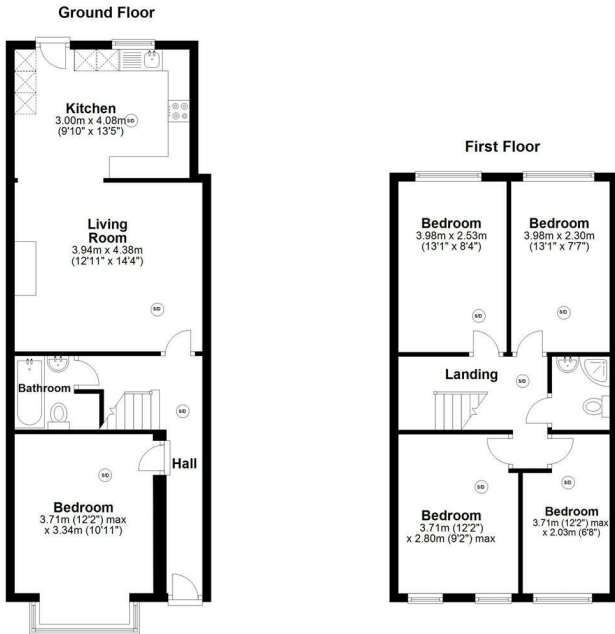
134 Milner Road, Birmingham