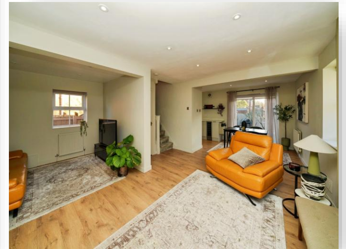
Willow Moss Close, Wirral, CH46 1SR