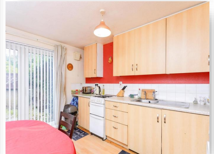
Towan Avenue, Fishermead, Milton Keynes, MK6 2DR