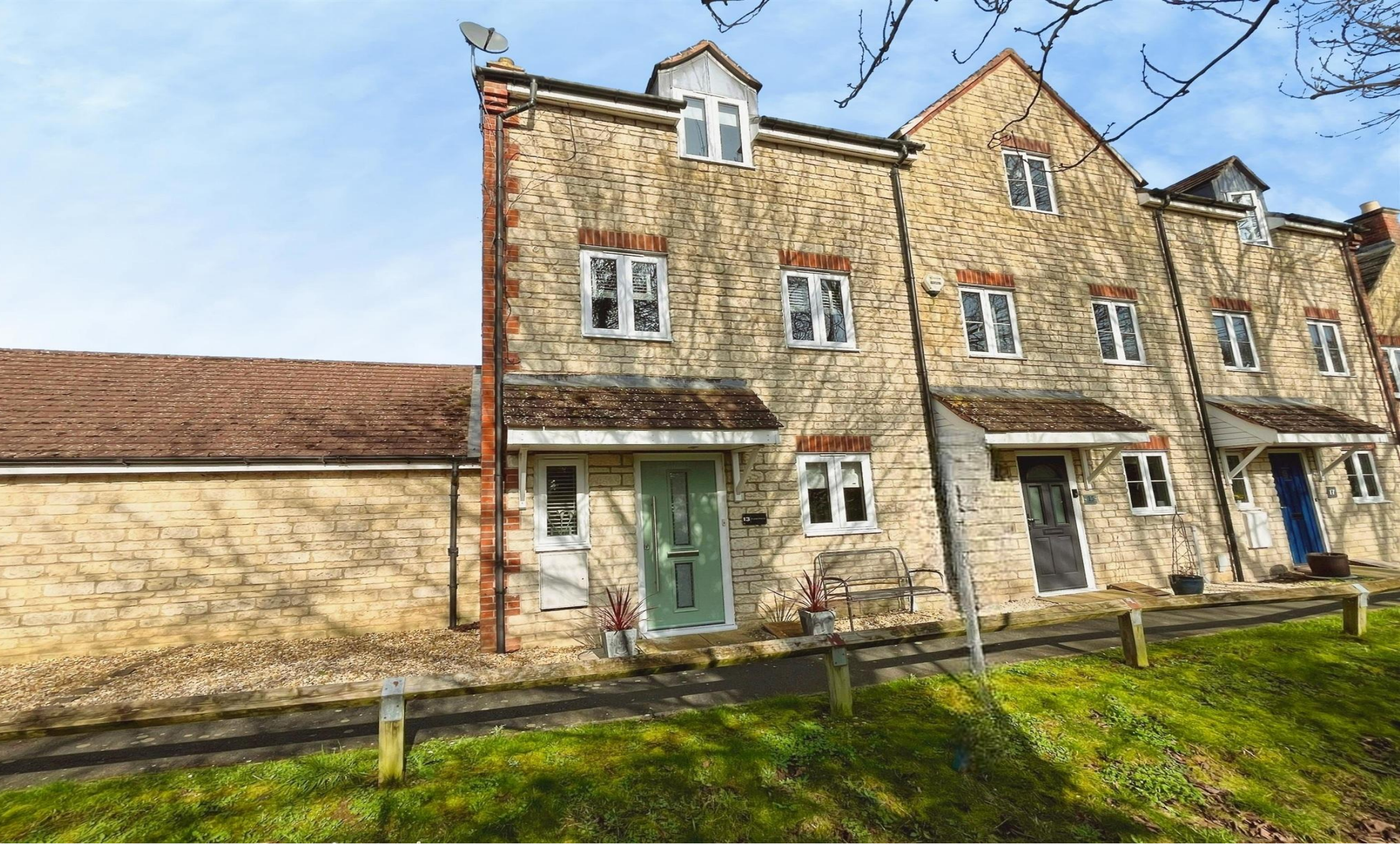
Farm Piece, Stanford In The Vale Faringdon SN7 8FA