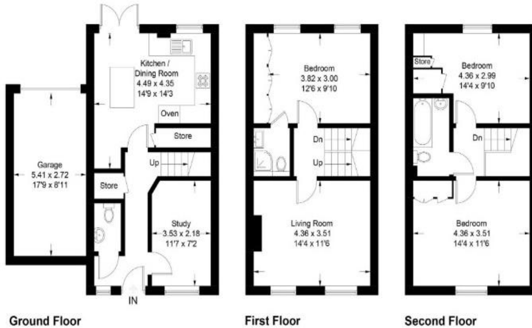
Illustration for identification purposes only, measurements are approximate, not to scale. Fourlabs co © (ID1267511)