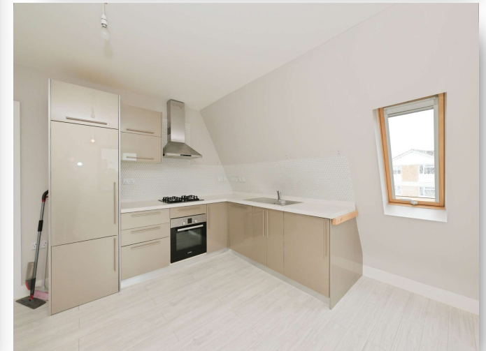
The Pond House 88-92 Turners Hill, Cheshunt Waltham Cross EN8 8LQ