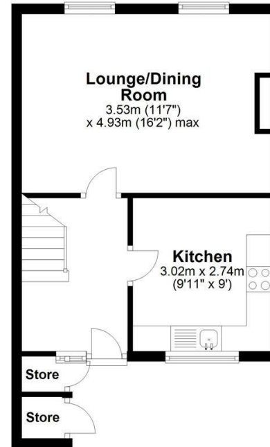
Lower Floor Approx. 34.2 sq. metres (367.7 sq. feet)