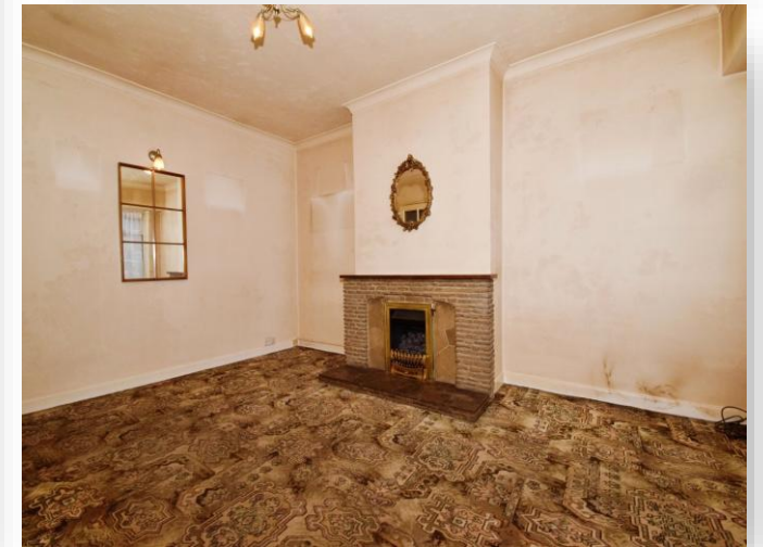
Foxhunter Drive, Oadby Leicester LE2 5FG