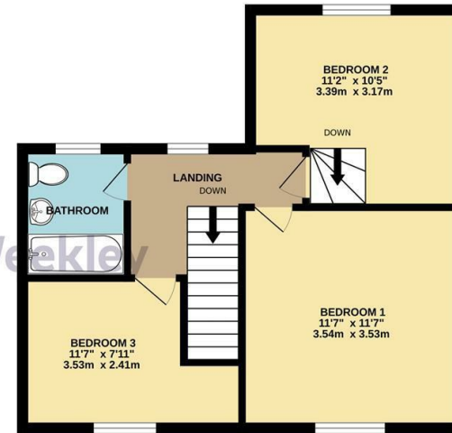
1ST FLOOR 422 sq.ft. (39.2 sq.m.) approx.