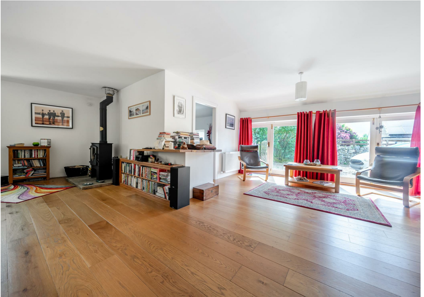
Rowan Barn Torpenhow, Torpenhow