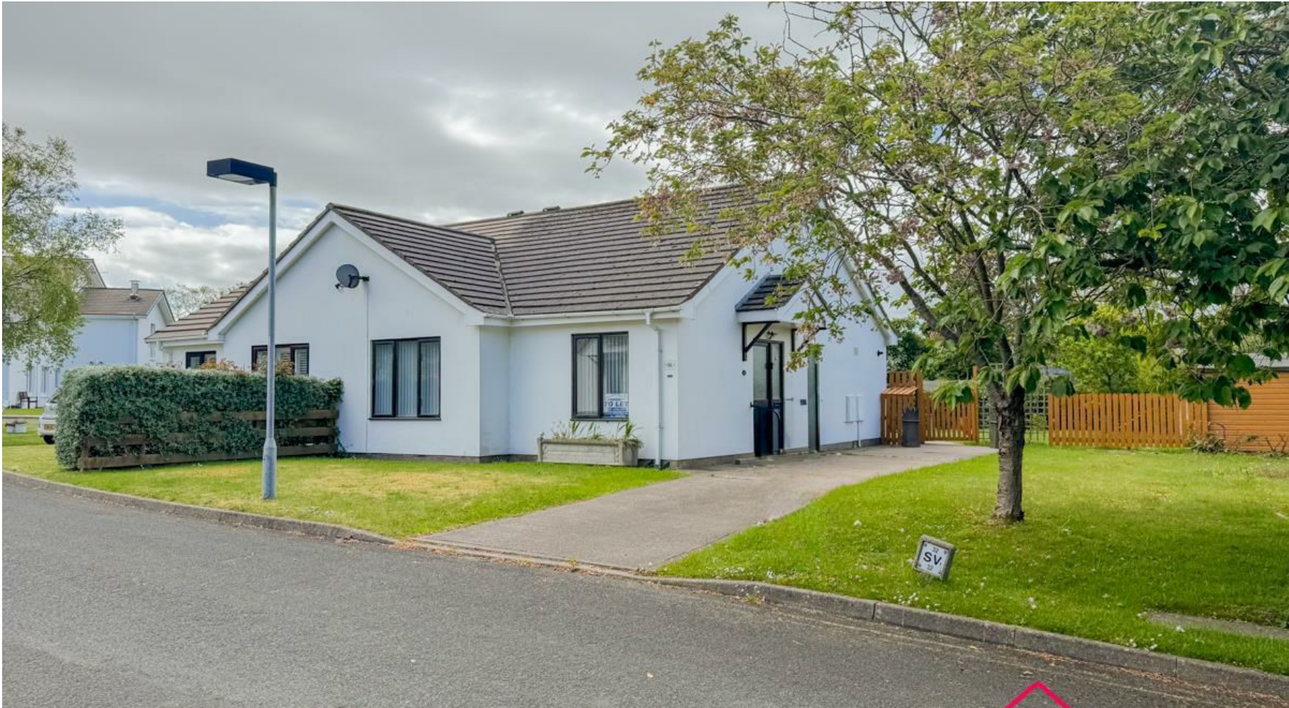
32 Cannan Court, Kirk Michael, Isle Of Man, IM6 1FA £349,950