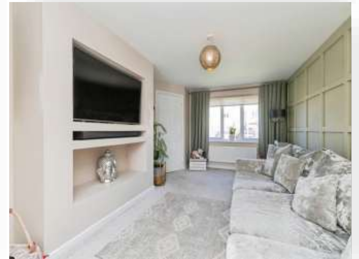
Opal Close, Hartlepool TS24 0GD