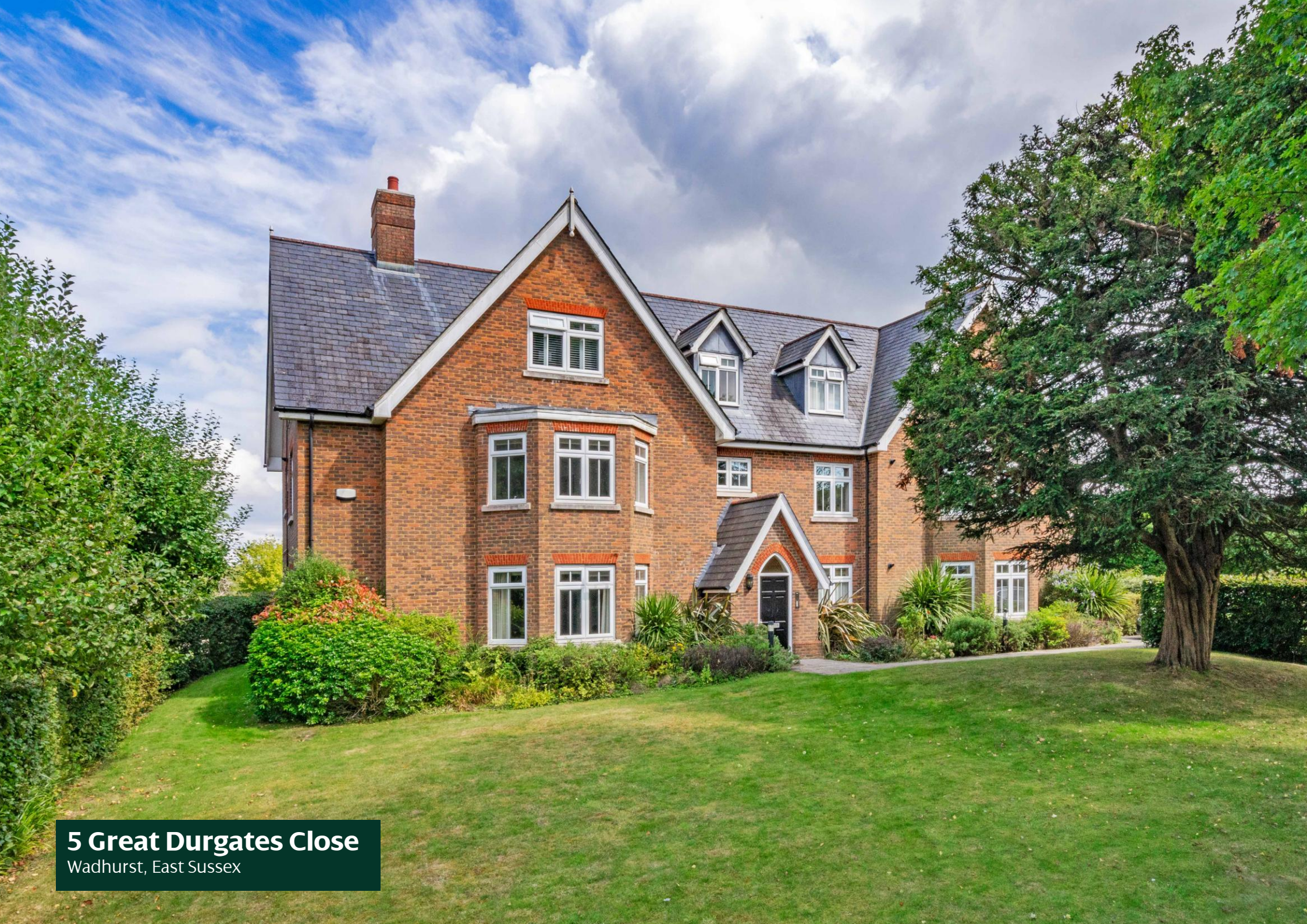
5 Great Durgates Close Wadhurst, East Sussex