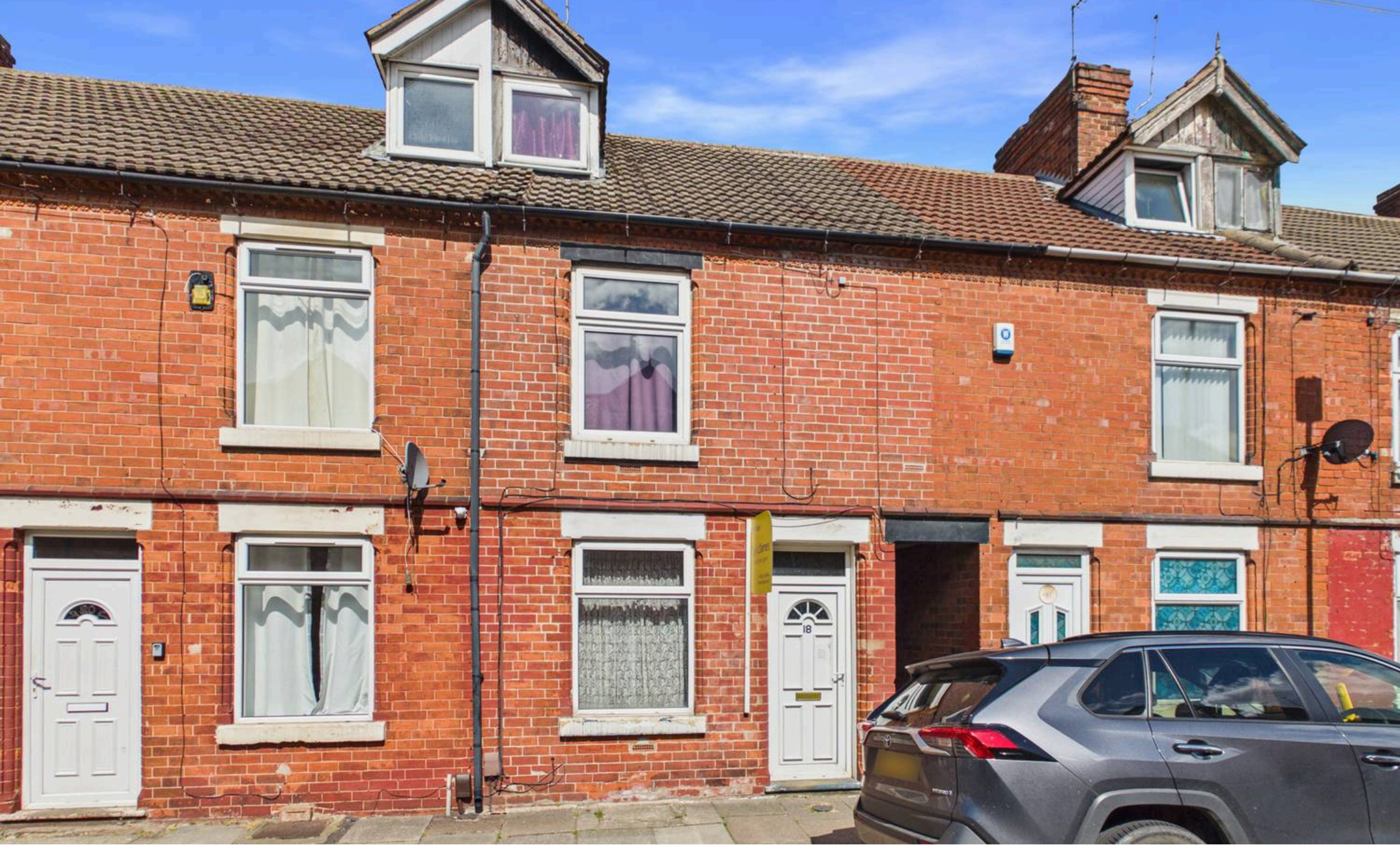
18 York Street, Sutton-In-Ashfield, NG17 2AG £90,000