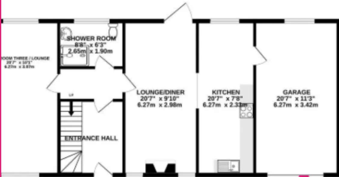
GROUND FLOOR 968 sq.ft. (90.0 sq.m.) approx.