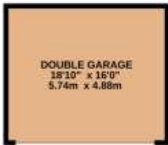
GROUND FLOOR 1128 sq.ft. (104.8 sq.m.) approx.