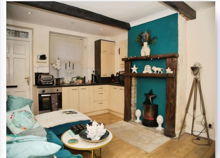
Church Terrace, Holmfirth HD9 1HD