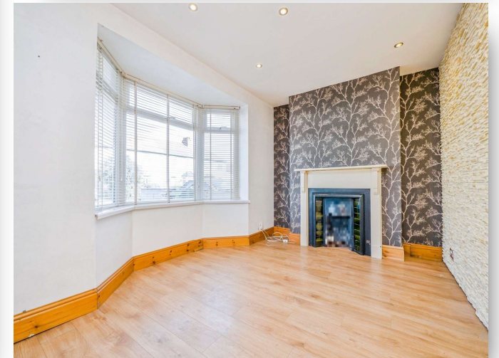
Dalmuir Road, Tremorfa Cardiff CF24 2PW