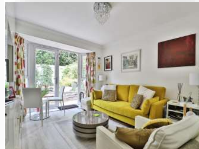
Richmond Heights Richmond Park Avenue, Bournemouth BH8 9DL